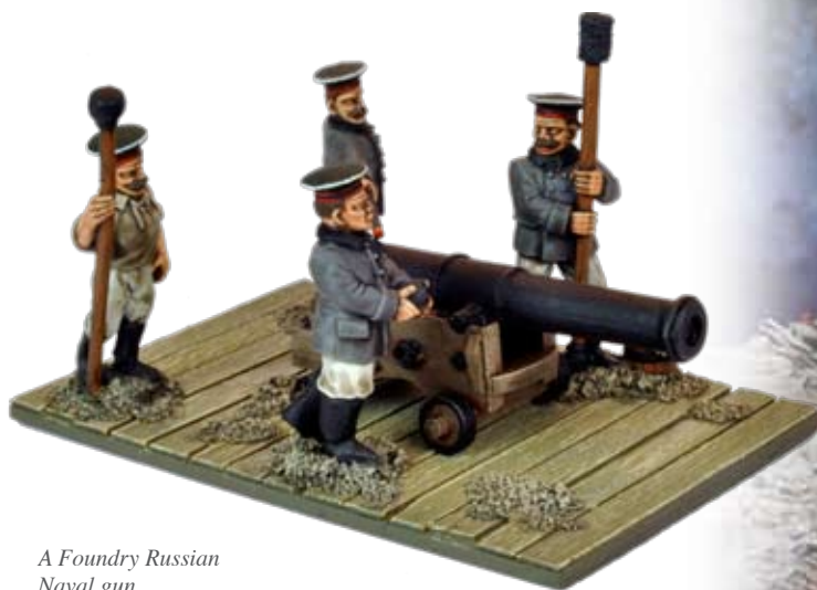
A Foundry Russian Naval gun.