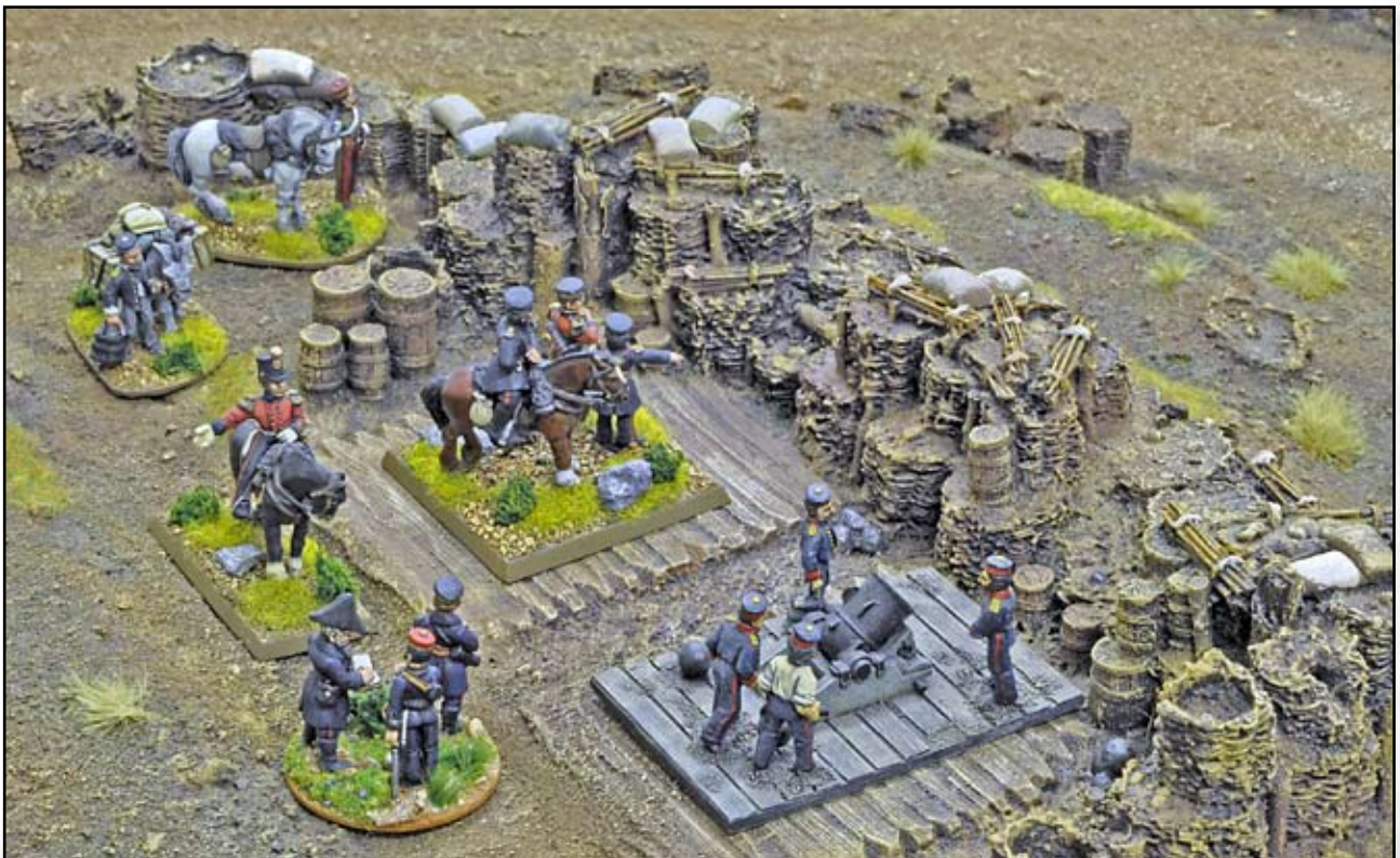
Below: The British Mortar Battery. Figures by Great War Miniatures and Foundry.

some Tars! The 24pdrs were able to range in on the 44th Foot who, on taking casualties, wavered and halted as their brigade mates marched onward into the teeth of the Russian fire! At this point the head of a Russian column appeared down the road between the defences and began to deploy into column of attack. The Mohilev Regiment had arrived from within the defences.