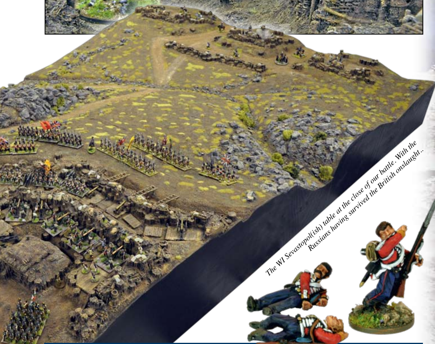
The WI Sevastopol(ish) table at the close of our battle. With the Russians having survived the British onslaught...