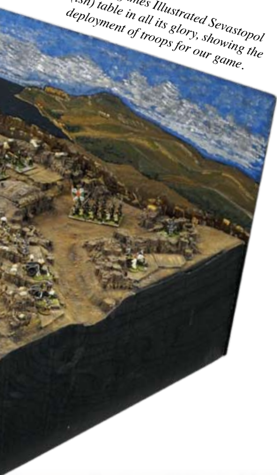
The Wargames Illustrated Sevastopol (ish) table in all its glory, showing the deployment of troops for our game.

collections that frustrated me as much as it pleased me. It looked so nice and I had put so much into it but, I never ever got to play with the toys and despaired as they languished in boxes under my gaming table for 12 years with the odd breakage here and there just to ratchet up my misery.