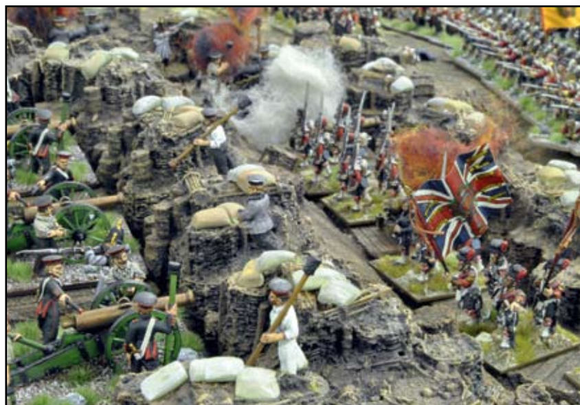
Above: The 42nd Highlanders continue to drive the Russian gunners from their trenches.

entire section attacked by the Highlanders free of enemy. Way back down on the right, the 44th had managed to steady themselves and reassemble, but they were far too distant from the action to play any further role.