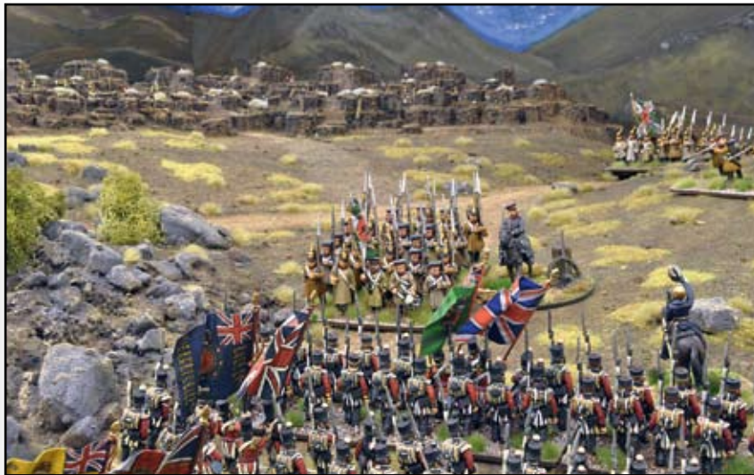
Below: Scenes from Turn 5. Including the 42nd breaching the Russian defences.

With the boot now on the other foot the British swung into action. The mortars were off target, landing their cargoes in dead ground between the fortifications; but the 68pdrs continued masticating the defenders of the front line trenches. This covered the deployment of the first battalions from the Highland and Guards brigades as they lined up to assault. Ade decided to counter charge the Mohilev with the 55th! His charge, led by the brigadier, was successful, but the Russian mass stood steady, fired and the 55th faltered, failing to close. In fact, they were pretty shaken up by the experience, falling into disorder and wavering in the face of the enemy! Not cricket by any manner of means ... those damnable Wussians!