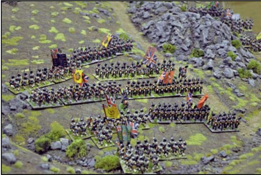
Above: The main British force lumbers forward.