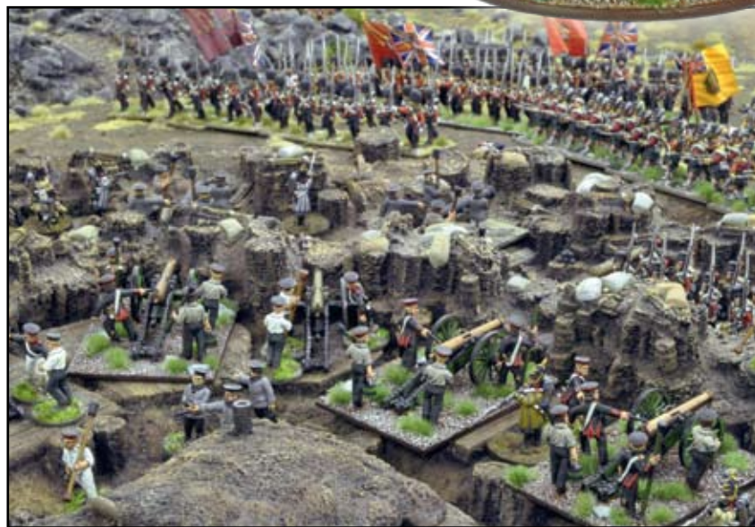
Above: The forward Russian line is in tatters, but there's still some big guns in the second line.