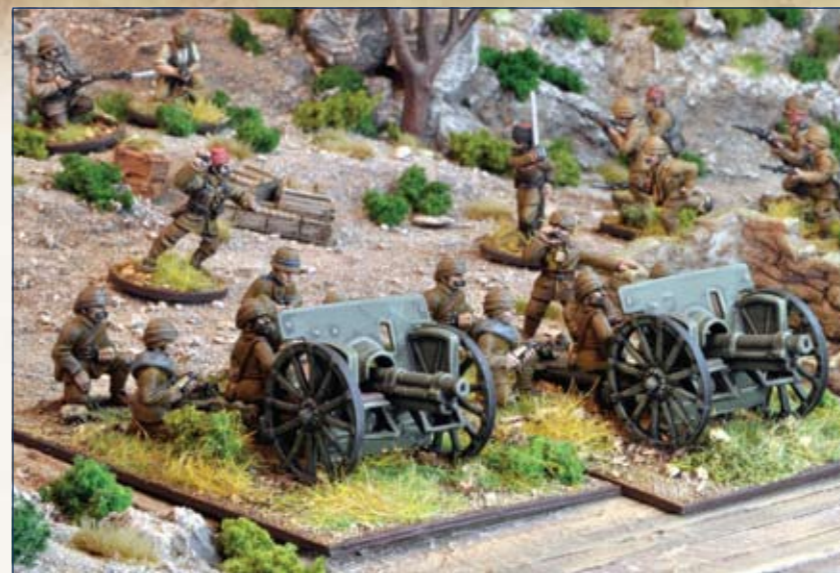
Above: Turkish crews man German-built 77mm Krupp guns to bombard the ANZAC troops.

After an artillery barrage designed to cut the Turkish wire and break through their