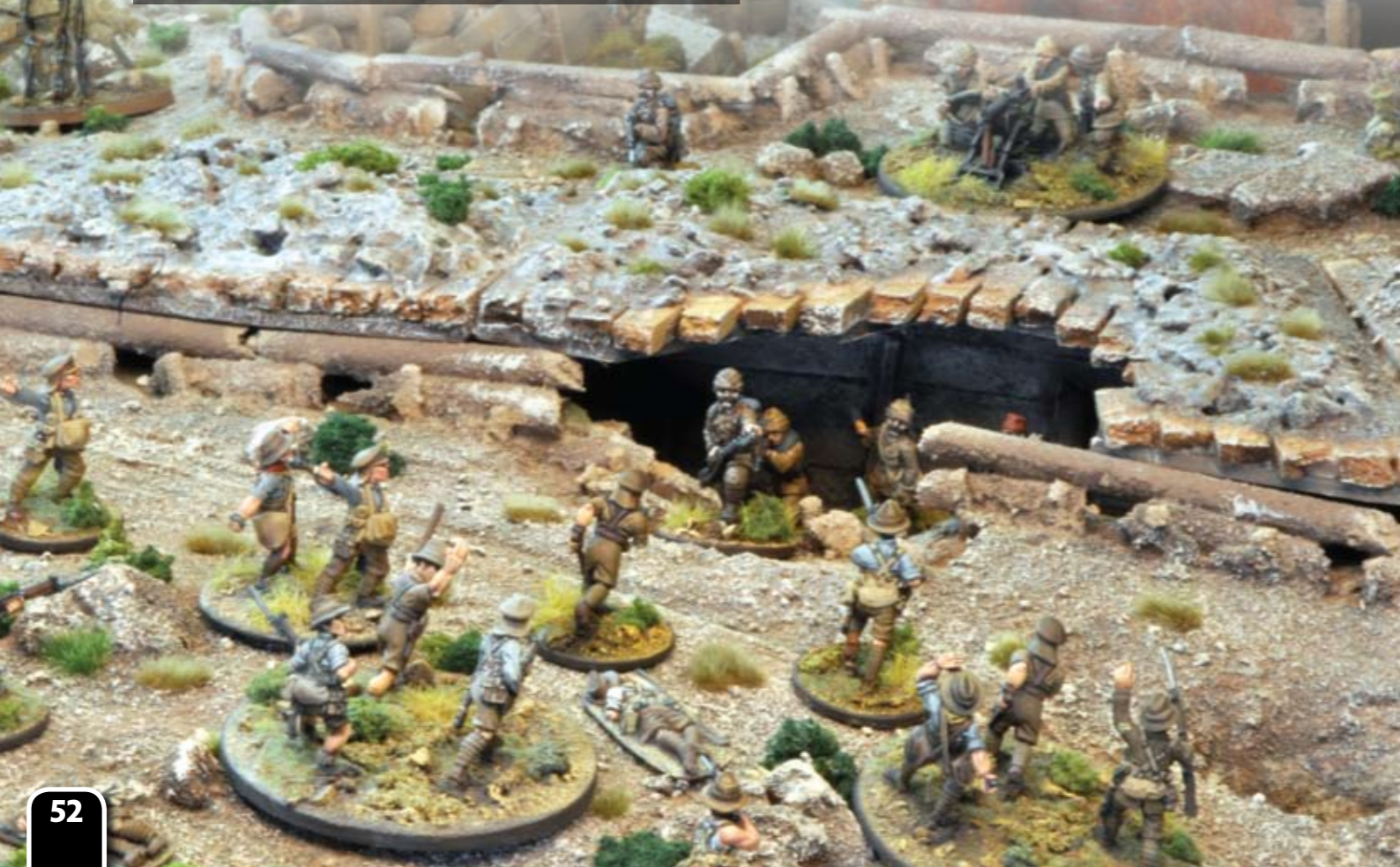
The relatively small, and inaccurate, "pre-push" bombardment did manage to open some holes in the Turkish fortified trenches.

Map from CAM8 - Gallipoli 1915, © Osprey Publishing Ltd. www.ospreypublishing.com